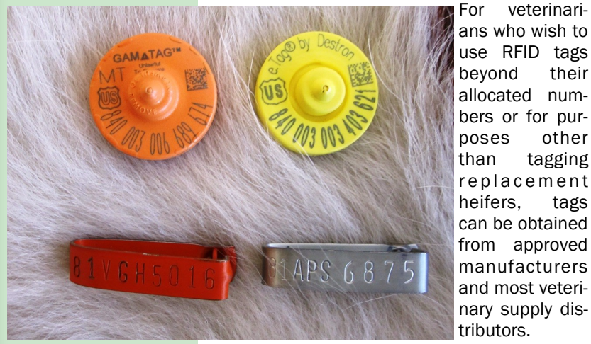
Figure 1. Official Identification

Tags can be obtained from the USDA directly. Please contact the USDA Veterinary Services (VS) Montana office at (406) 449-2220 to order. Veterinarians can order orange 840 RFID or orange metal tags for brucellosis vaccination: or white/yellow RFID or silver metal NUES tags for other tagging purposes. The number of available RFID tags is limited based upon a veterinarian's historical use and again, no-cost RFID tags are only to be used in replacement females.